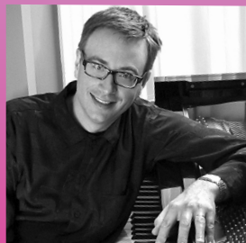
John Kramer Piano

Come for an extraordinary evening of vocal music featuring selections from opera, musical theater, art song, and jazz. These four singers have performed with the Boston Lyric Opera, Boston Opera Collaborative, throughout New England, and nationally. These talented performers promise a delightful evening of song.