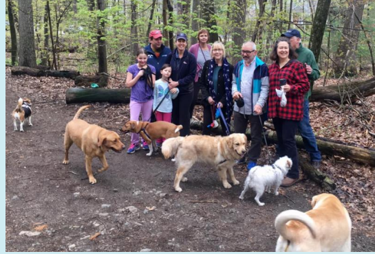
Photo: A recent WBID gathering. Sometimes the end-of-walk photo is hard to organize!